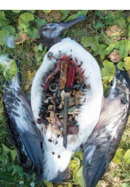
▶ Figure 56.27 A victim of plastic waste. Found in a wildlife refuge in Hawaii, this Laysan albatross (Phoebastria immutabilis) chick died after consuming large amounts of plastic

plastic waste may introduce new pathogens to a reef or increase the abundance of pathogens already present. In addition, plastic waste that becomes entangled on a reef can damage corals or deprive them of light and oxygen, making them more susceptible to pathogens.