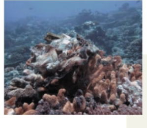
► Figure 56.28 Plastic waste and disease in corals. A 2018 study found that the percentage of diseased corals increases 20-fold in reefs contaminated by plastic waste. The photo shows plastic waste on coral at one of the study sites.